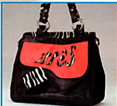
• day tote

Introducing the IPPOS On The Circuit Collection, a unique interpretation of faux leather and faux suede products and accessories for active people. Our apparel totes, day totes and duffel totes are designed to efficiently organize riding apparel and related gear with artistic and custom elements inspired by the equestrian spirit.