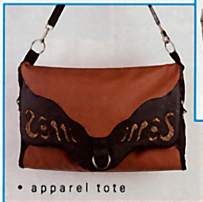
• apparel tote