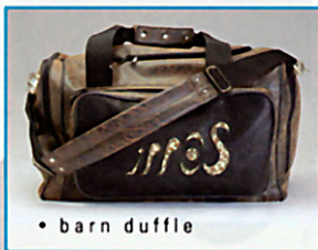
• barn duffel