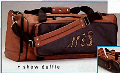
• show duffel